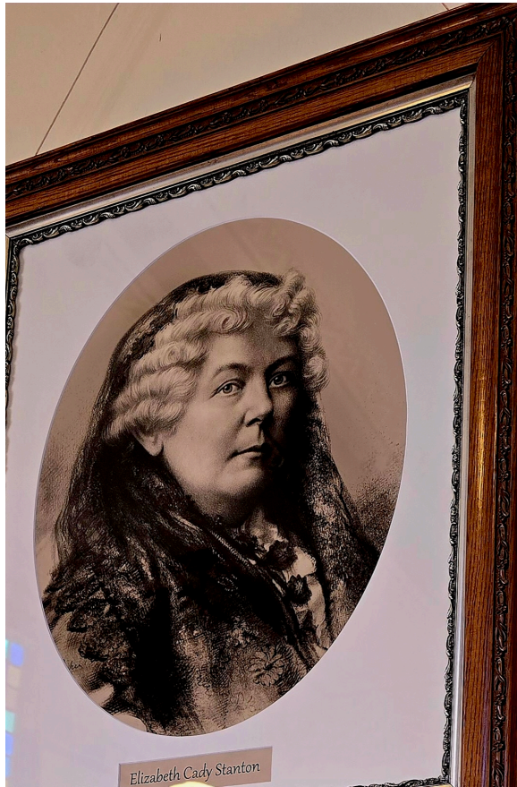
Elizabeth Cady Stanton